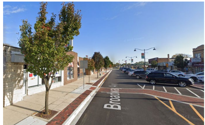
Google Street View Images of Ogden Avenue Streetscaping (left) and Broadway Avenue Streetscaping (right)

More specifically, the Village could work with IDOT (who has jurisdiction over Ogden Avenue) to modify the mountable curb that currently exists such that drivers would not be encouraged to park on the sidewalk. Together, these streetscape improvements could help to attract new and revitalized businesses along the corridor. The panelists also suggested that Village staff work to build on the existing gateway signage on Ogden Avenue at the Village’s western border to create a more inviting and appealing entrance to the community. In addition, the panelists recommended that the Village activate the study area by holding short-term pop-up events that encourage residents and visitors to come to the study area, which may help establish the site as a destination of importance within the Village. The Village could also construct a temporary green space in the study area that could serve as a venue for such events and help to catalyze activity in the area. Activating the space with short-term activities and open space could help residents envision how the study area can serve as a community asset in the long term while also creating a clean and enjoyable site in the short-term.