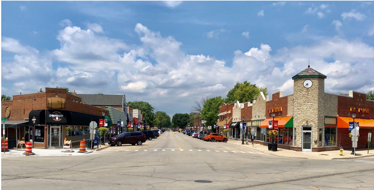
Grand Boulevard in Downtown Brookfield at the intersection of Prairie Avenue, Brookfield Avenue, and Fairview Avenue, looking northwest

While the mixed-use redevelopment project envisioned by the Village is not feasible at this time, the panelists did consider one scenario for the study area, which could serve to address a challenge facing one of the local, nearby businesses. The Village shared the example of the Galloping Ghost gaming business, which is located on Ogden Avenue and is currently spread across multiple buildings and several disjointed blocks. The panelists envisioned how a new, consolidated, single facility in the study area could improve the customer experience for Galloping Ghost patrons and facilitate improved business operations. Additionally, because the Galloping Ghost doesn't serve their own food or beverage, the panelists noted that locating the Galloping Ghost adjacent to the newly redeveloped Imperial Oak Brewing pub could activate the study area as a community destination. Furthermore, the panelists recommended that Village staff broaden the set of potential uses they are considering for the study area, including health/wellness, medical, entertainment, and open space. The panelists stated that if the Village wanted to consider a destination or family entertainment venue, including ideas such as a splash pad or an e-sports center, the Village should consider hiring a consultant to examine the feasibility of these potential uses.