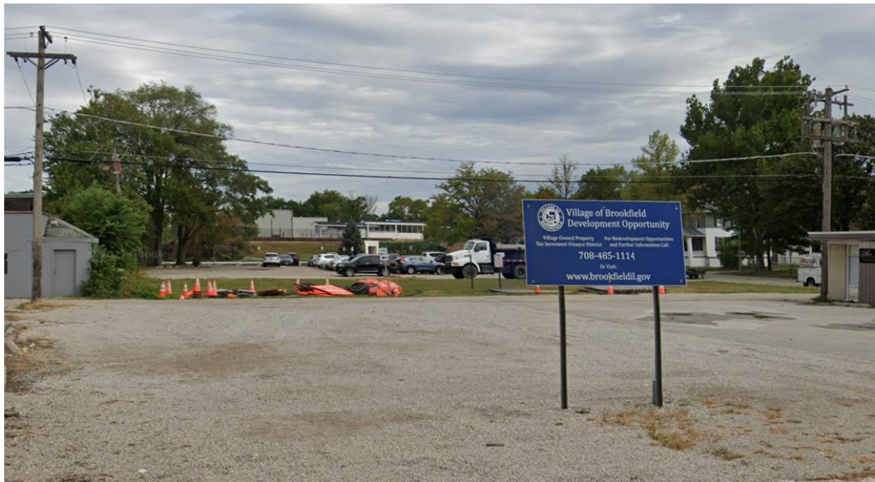
Google Street View Image of Study Area and Development Opportunity Advertising Signage