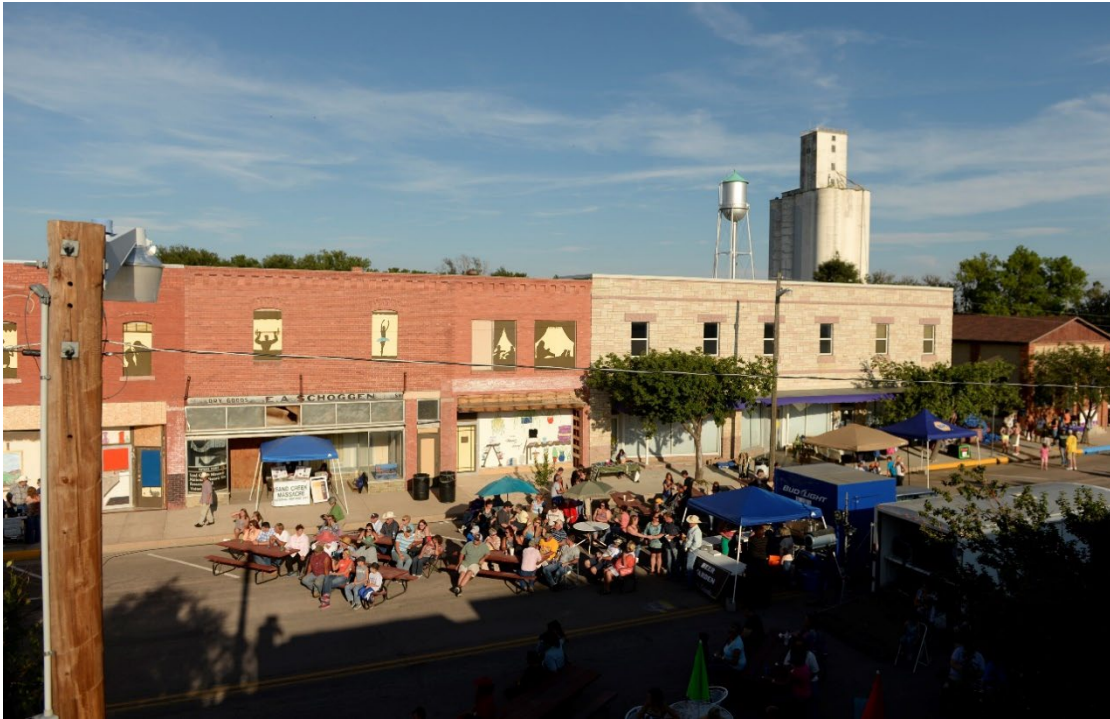
Eads Maine Street Bash Pop-Up Event in Eads, Colorado.