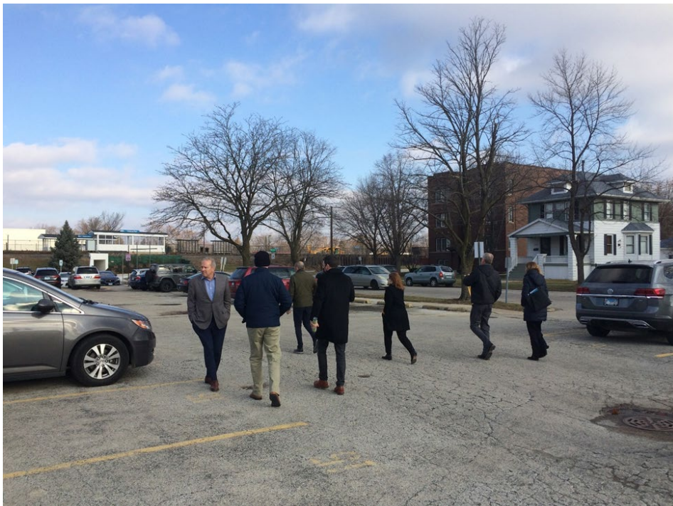
Developer Discussion Panel Participants During Site Visit to Study Area, December 16, 2021

The developer panel discussion generated a variety of recommendations that can generally be separated into three groups: change the timing of development in the study area, prime the study area for future development, and promote developer-friendly programs and zoning changes. Although the panelists were able to develop actionable recommendations for Village staff, the panelists reached consensus that the type and scale of development sought by the Village in the study area would likely not materialize in the near future. This is evidenced by the similar projects previously proposed, which have not progressed. The panelists noted that developers would likely be apprehensive about pursuing a 4-5 story mixed-use development with ground floor retail in the study area because of a lack of access to walkable destinations from the site, the limited community amenities nearby, the study area’s smaller parcel sizes, and site access concerns caused by the tracks to the north, which act as a barrier. The panelists stated that commercial developers generally seek to locate retail developments (specifically big box, national retail) near other commercial buildings and that the absence of adjacent commercial development may be a deterrent for developers. The panelists added that prospective renters seeking to rent both market-rate and affordable units in the area would likely want to be in a location that allows them to walk to restaurants, bars, and other commercial uses.