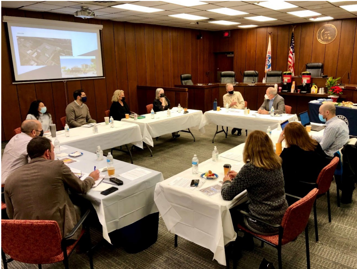
Developer Discussion Panel at the Brookfield Village Hall, December 16, 2021